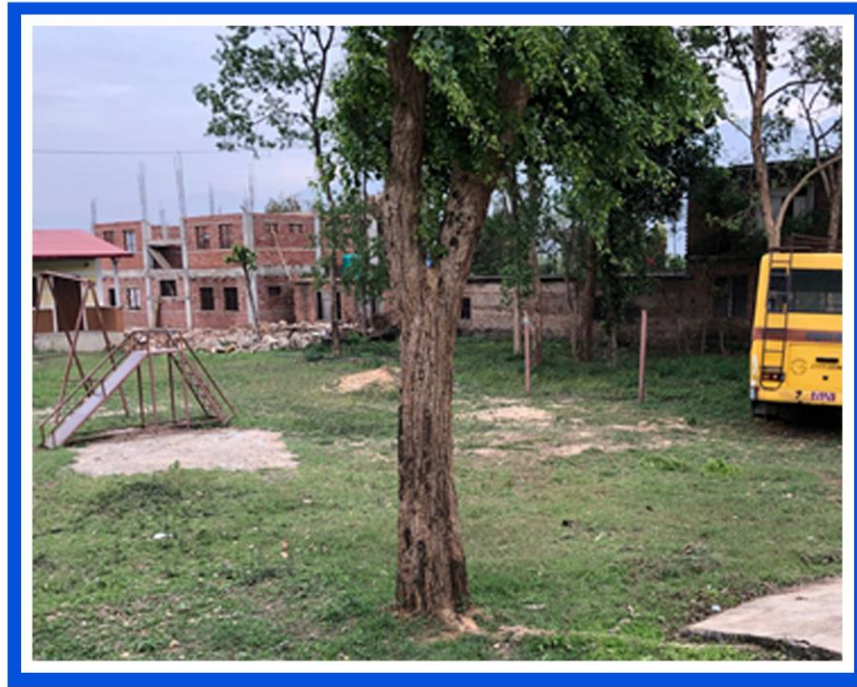
Figure 8. Boys' hostel, Shree Shanta Deaf & Hard of Hearing Residential Basic School.

[Image description: A yellow school bus rests at the right beside a tree in the foreground. To the left of the tree is a metal slide and swings. Behind the swings is a yellow-and-brown building with a light red roof and a terracotta brick building under construction.]